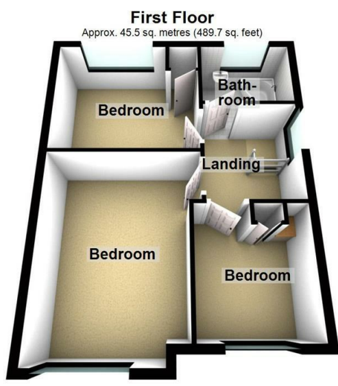
First Floor Approx. 45.5 sq. metres (489.7 sq. feet)

Total area: approx. 113.4 sq. metres (1220.6 sq. feet)