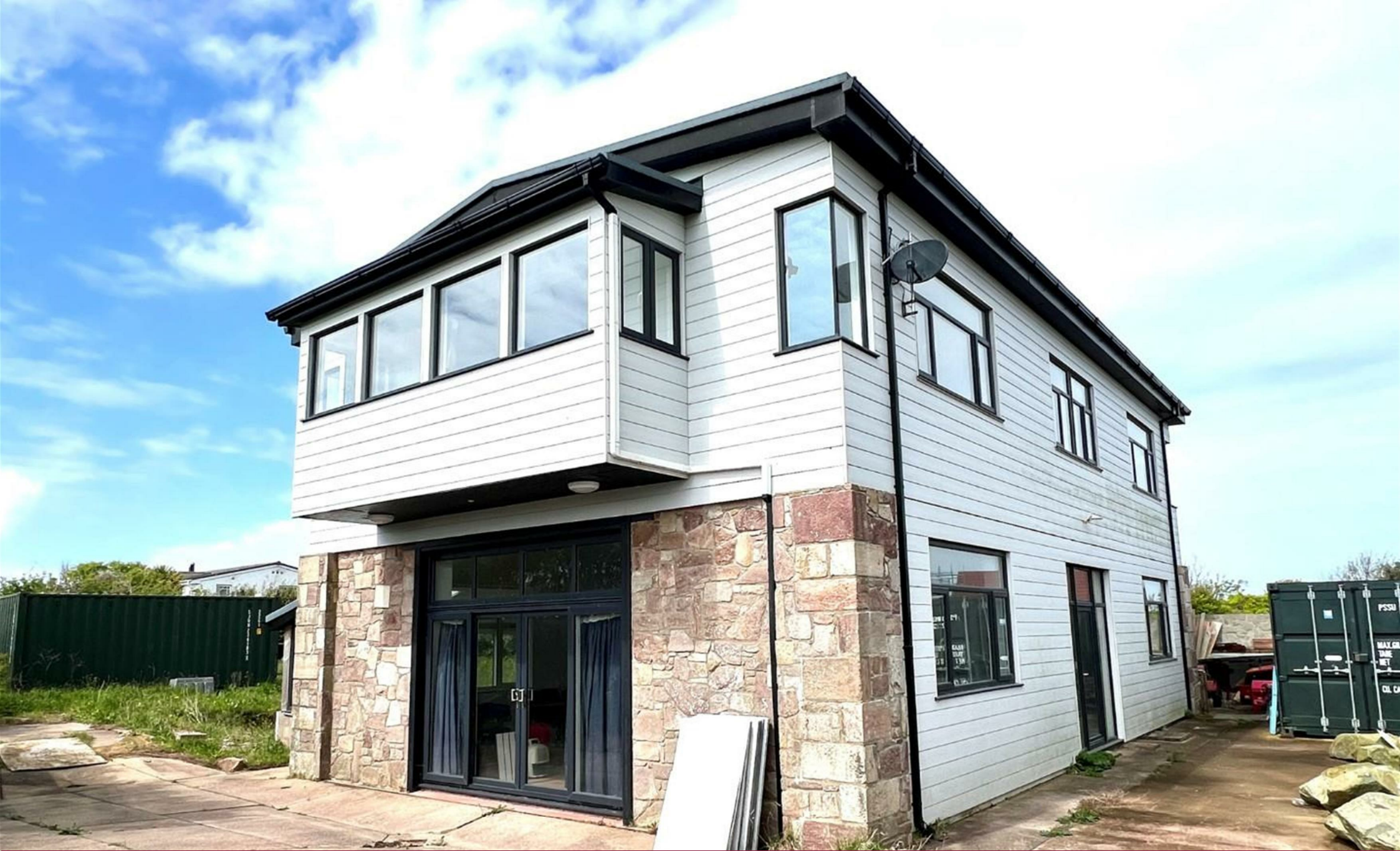
An amazing detached house set within it's own private grounds with panoramic sea views