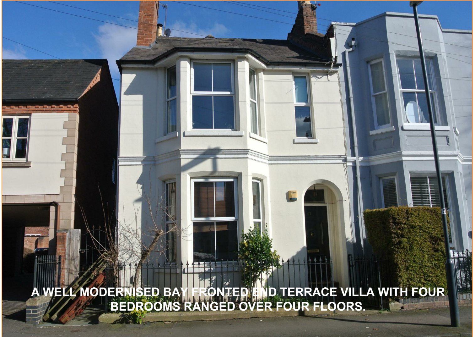
A WELL MODERNISED BAY FRONTED END TERRACE VILLA WITH FOUR BEDROOMS RANGED OVER FOUR FLOORS.