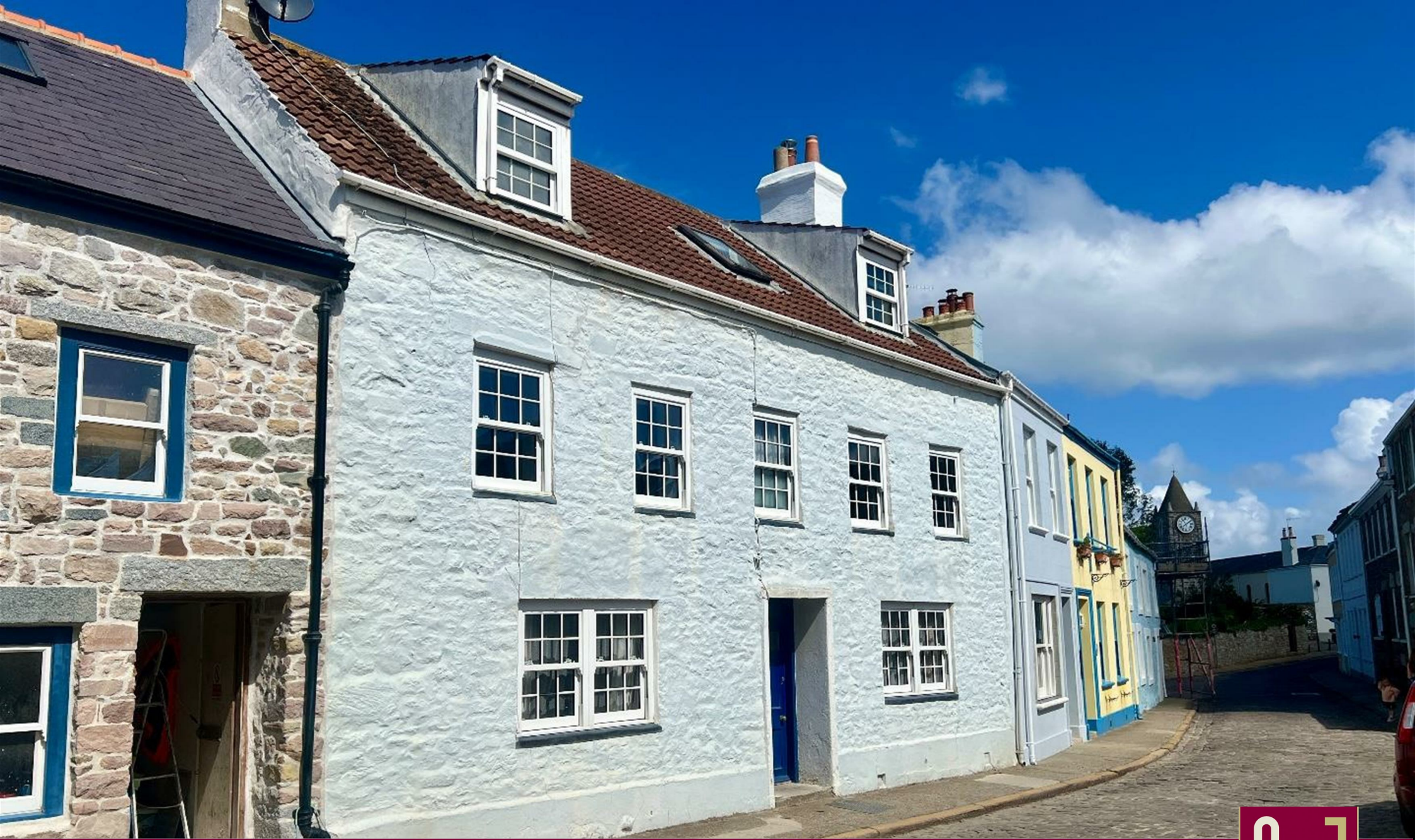
Le Huret, Alderney £410,000